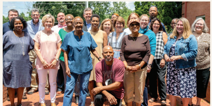
Thank you to our valued 20-plus year teammates!

With this event, CHS launched its new Service Award Program to recognize our valued employees who give their best to the children and families we serve day-to-day throughout the years.