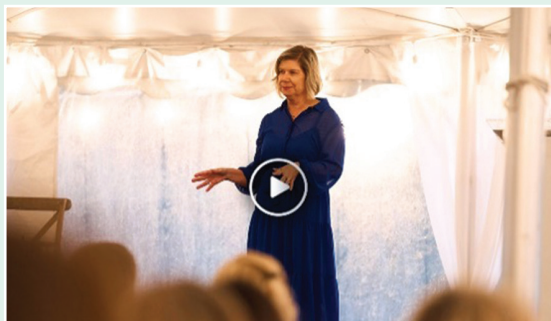
A Place to Call Home 2023: Speaker Excerpts